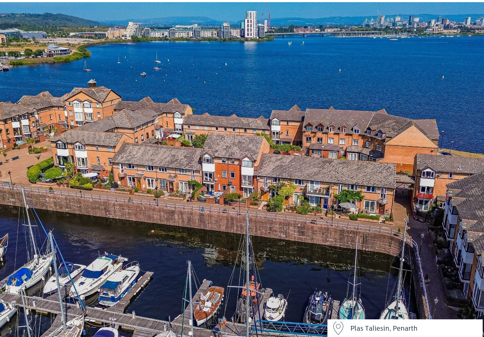
Plas Taliesin, Penarth